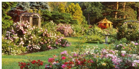
Find a relaxing spot and spend some quiet time

Try progressive relaxation techniques, yoga.